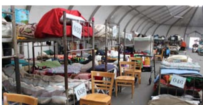
Single Adult Emergency Winter Shelter, 200 beds for homeless San Diegans – Downtown San Diego

The Single Adult Emergency Winter Shelter (200 beds) and the Veterans Emergency Winter Shelter (150 beds) closed Tuesday, July 1, ending their longest run ever. They will reopen around Thanksgiving for regular operation during the winter months.