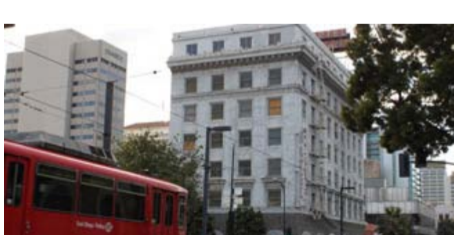
The Churchill was built in 1914 827 C Street, Downtown San Diego

SDHC and its nonprofit affiliate, Housing Development Partners (HDP), are collaborating to preserve this affordable housing from the former Hotel Churchill, which was built in 1914. When completed early in 2016, The Churchill will set aside 56 units for veterans and 16 units for transitional age youth.